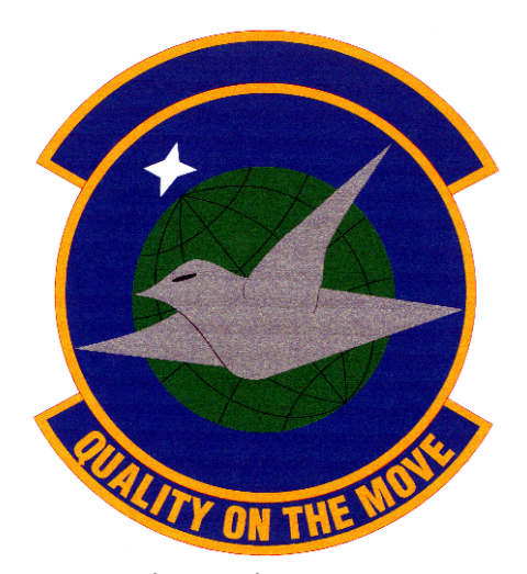
Approved, 15 Feb 1996